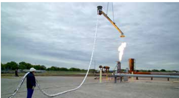
INDUSTRY-LEADING FLARE EMISSION TESTING EXPERTISE

Our engineers routinely perform CFD analysis on innovative flare technologies to optimize performance and streamline the development cycle of those new technologies. Those CFD simulation results are then validated by experimental data from our test facility. Our engineers also utilize CFD to assess flare performance and environmental impact at customer sites.