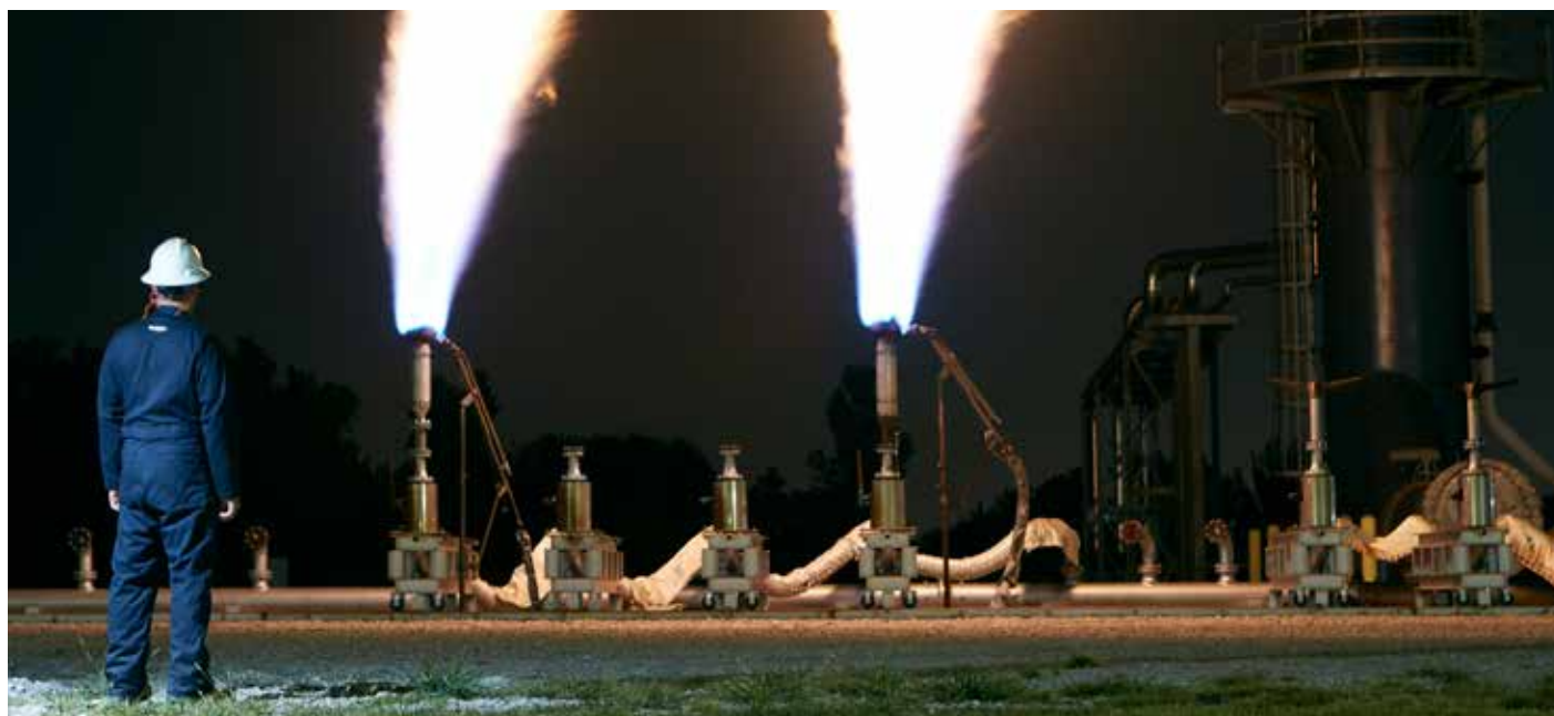
JZ INDAIR FIRST STAGE BURNERS

The first stage of most MPGF systems requires a burner design that can produce smokeless flaring at turndown from purge rate to maximum rate. This typically requires utilizing steam-assisted or air-assisted burners on the first stage, which adds complexity to the design and controls. It also requires continuous utility usage (steam or blower power). This increases the likelihood of over-steaming or over-aerating the burners which produces decreased hydrocarbon destruction efficiency. The JZ Indair first-stage burner design utilizes a variable-slot mechanism to produce 100 percent smokeless flaring from purge through maximum flow rate without the use of any outside utilities. This provides a low-maintenance, simple operation design that is guaranteed to produce high DRE without operator interface.