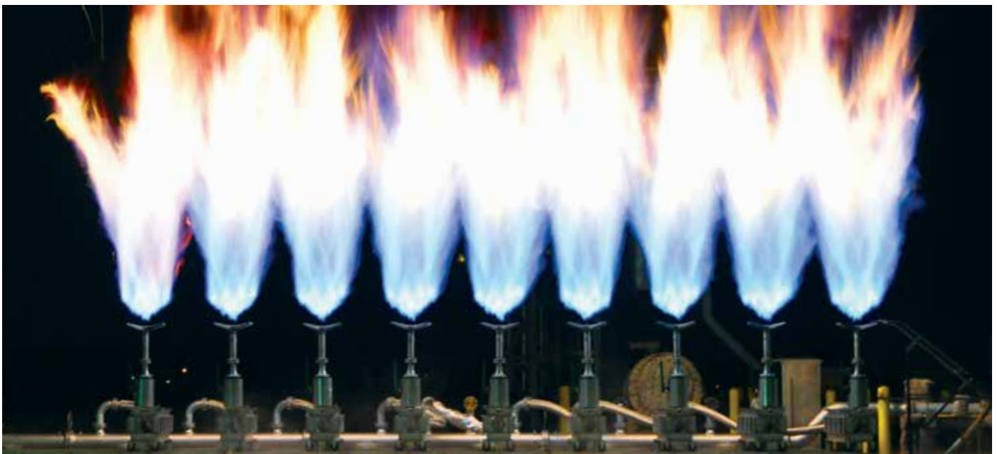
FULL-SCALE LRGO BURNER TEST FACILITY