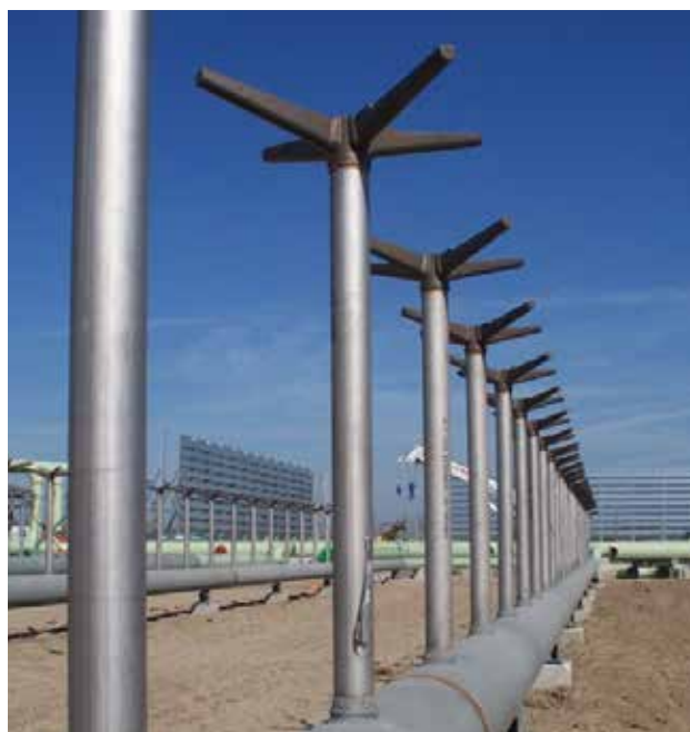
LRGO – HC BURNERS