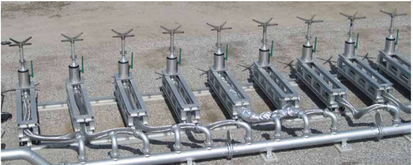
Our unique multi-burner test facility can achieve multiple burner configurations via a rail-system that enables multi-dimensional movement of full-scale burners.

Our state-of-the-art design capabilities are backed by actual field verification gained through decades of experience designing some of the largest MPGF systems in the world. We have provided LRGO flare systems in numerous applications, including olefins and polyolefins, aromatics, LNG production, oil and gas production, refineries, pipeline operations, and more.